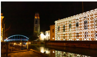
Boston Brilliance - Light Projection Festival