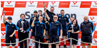
Motorsport - Boston College Racing Team