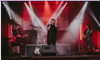
Live Performances at Iconic Venues